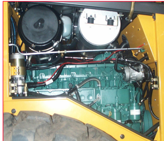
Detection tube, piping & nozzles