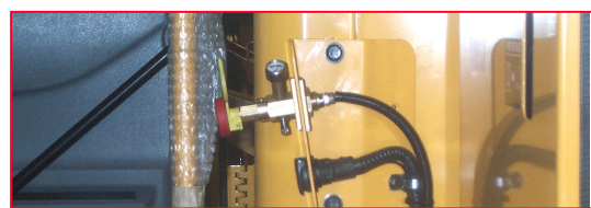
Manual release, manometer & filling nipple