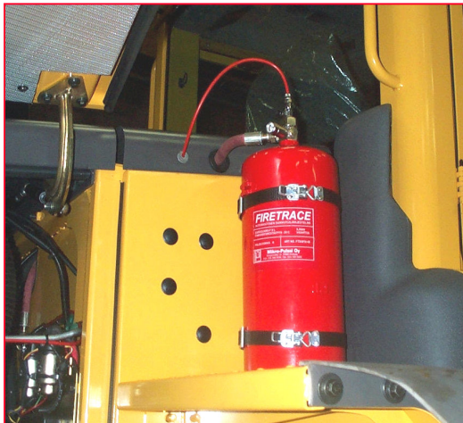
Safeguard-bottle & release valve